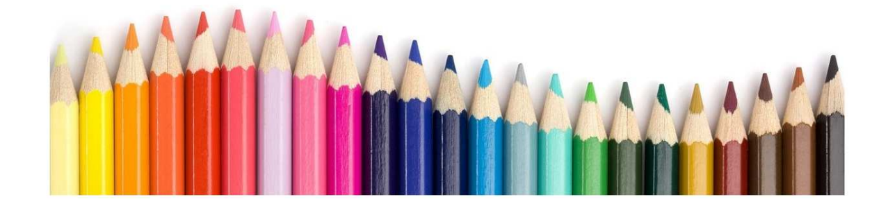
Continue on next page